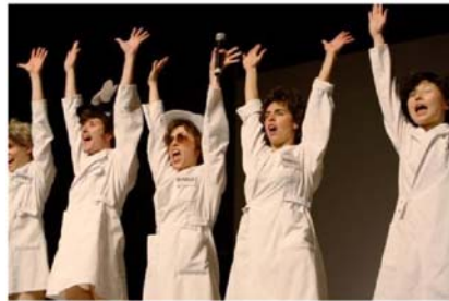
XL, because size does matter

For more information: www.mc-villalobos.com