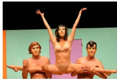
M, a medium-sized piece